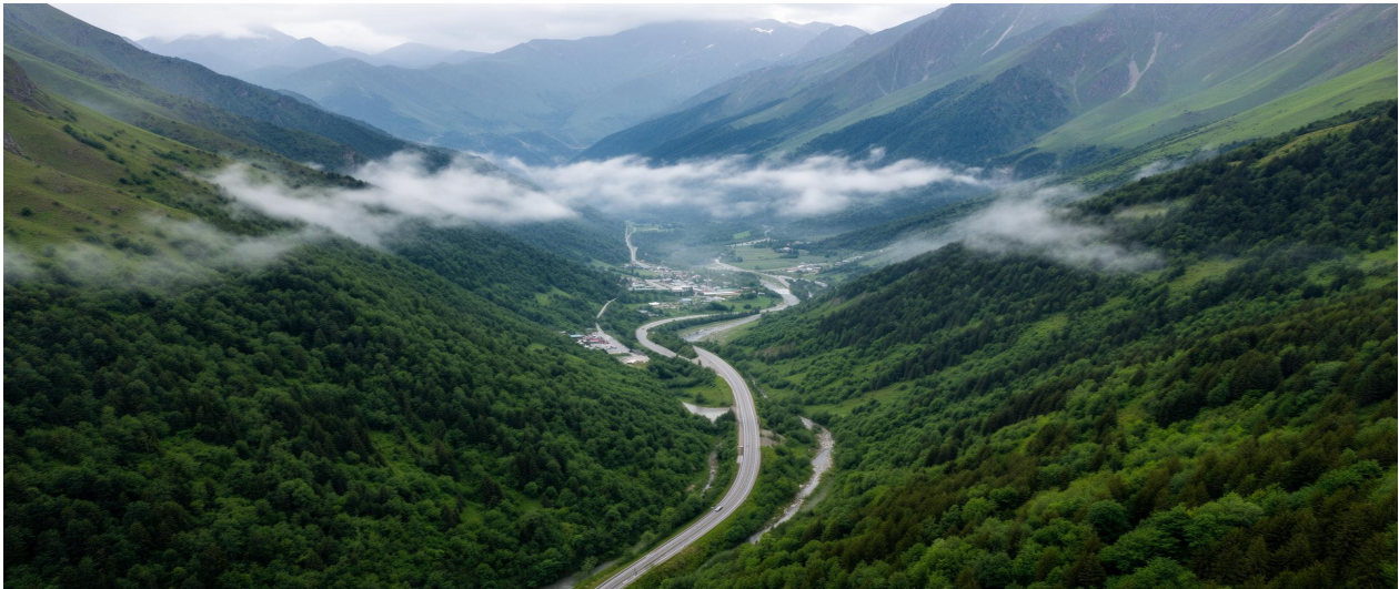
Georgian landscape — between the Caucasus mountains and the Black Sea.

Marina-front branded residences on the Black Sea coast.