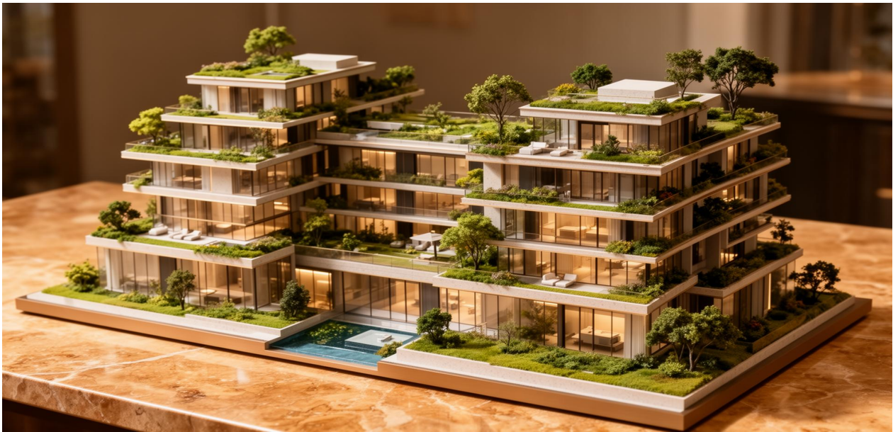
Architecture model — Verdea design studio, Tbilisi.

From land acquisition to handover, every Verdea development is delivered through a single, integrated team — supported by a network of institutional partners.