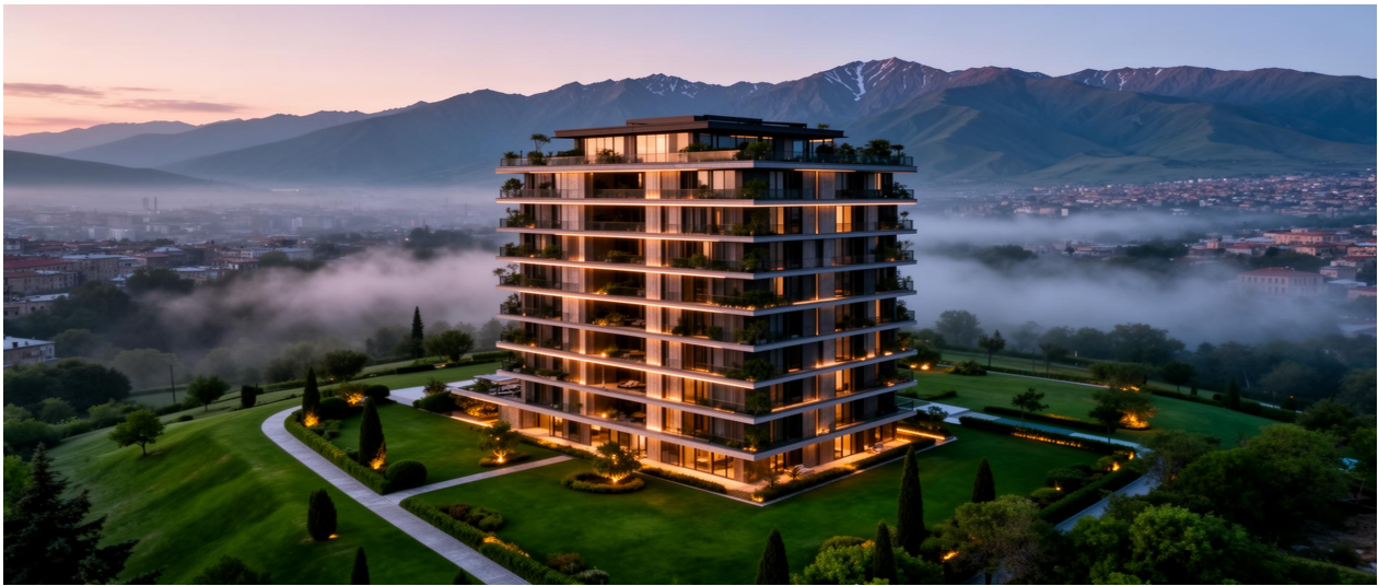
Tbilisi — central business and residential district.